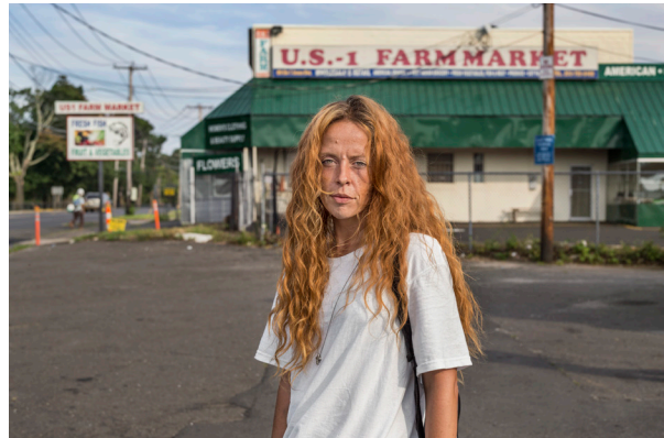
Jim Goldberg, US-1 , 2014. Archival pigment print.

Wylie’s A Good and Spacious Land , by contrast, is a look at the city from an outsider’s point of view. His encounter with New Haven coincided with the reconstruction of Interstates 95 and 91 and the dramatic merge where the two come together, an enormous feat of engineering that appealed to his artistic sensibility. The omnipresent roadways in Wylie’s images suggest mobility and speed, a way in and out, and the possibility of passing over and through the city; the construction-in-progress that he captures further implies an ongoing faith in the promise that