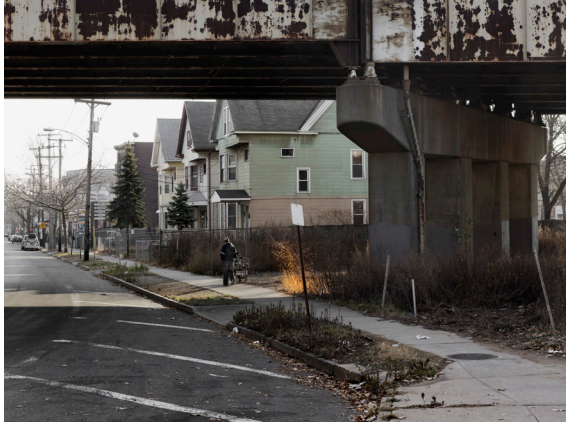
Donovan Wylie, New Haven, Connecticut , 2013. Photograph.

mobility holds. But Wylie’s roadways also frame the urban and natural landscape between and beneath the highways, highlighting the people and the human habitat that lie in the shadow of the massive transportation structure.