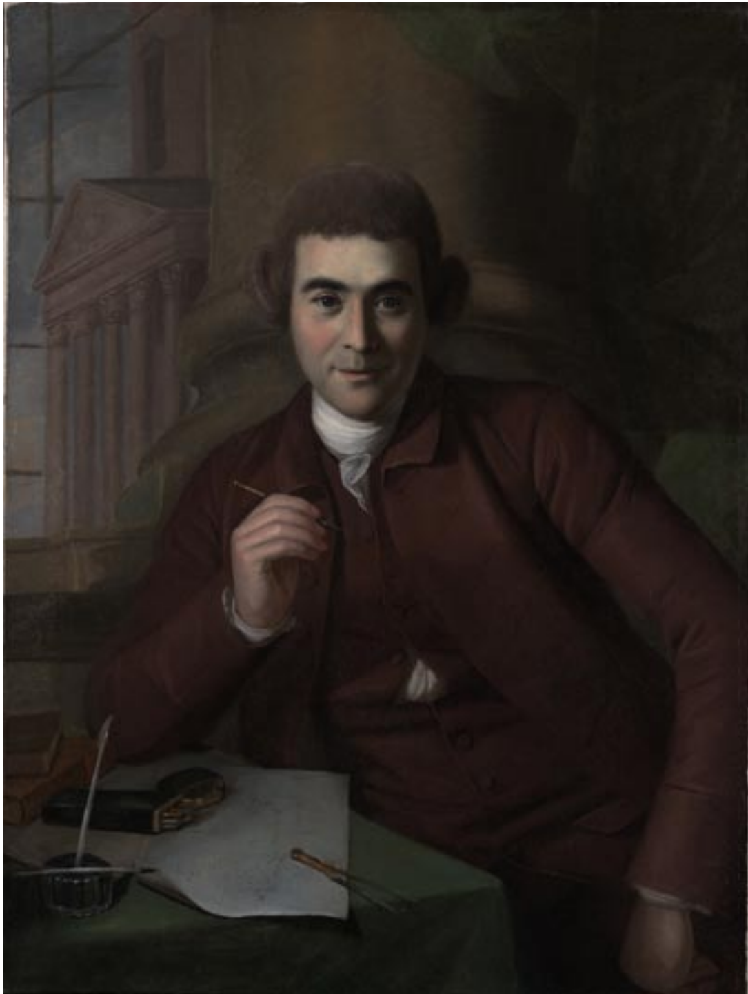
Charles Willson Peale (American, 1741-1827) William Buckland (1734-1774), 1774 and 1789 Oil on canvas, 27 1/2 x 36 5/8 in. (69.9 x 93 cm) Yale University Art Gallery, Mabel Brady Garvan Collection 1934.303