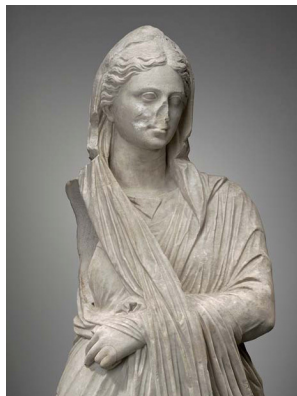
Pre- and post-conservation images of Figure of a Woman, Roman, 1st century B.C.–early 1st century A.D. Marble. Yale University Art Gallery, Purchased with the Ruth Elizabeth White and Leonard C. Hanna, Jr., B.A. 1913, Fund

Acquired in 2007, and affectionately known to Gallery staff as the “Green Lady,” due to the algae that once marred its surface, the statue has undergone extensive cleaning and conservation. A larger-than-life, high-quality portrait statue with idealized features and careful attention to the details of dress and pose, the statue is an example of the pudicitia portrait type (from the Latin word meaning modesty), which was meant to make a strong statement about the character of the subject.